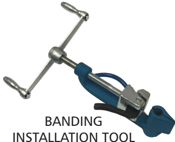
BANDING INSTALLATION TOOL