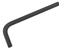
L STYLE PINNED ALLEN WRENCH 3/16" AND 5/32" AVAILABLE