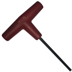
T STYLE ALLEN WRENCH 3/16" AND 5/32" AVAILABLE