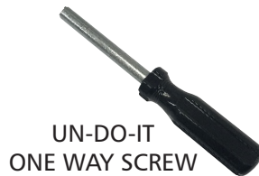
UN-DO-IT ONE WAY SCREW REMOVAL TOOL