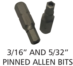
3/16" AND 5/32" PINNED ALLEN BITS